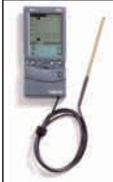
Figure 1. ImagiProbe setup: PalmPilot, D/A converter, probe.

The idea of hooking sensors up to a computer and taking scientific measurements is not new. And the educational value of conducting sensor-based science with desktop computers has been well established by many researchers. Even if they're only studying the effect on pH when adding vinegar to distilled water, the ability to collect data and plot it in real time motivates kids to learn more science. However, what's different in the Dave/Rhonda vignette is its description of the educational potential of placing inexpen-