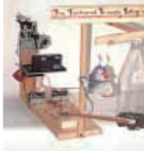
Figure 5. Child-constructed sensing device.